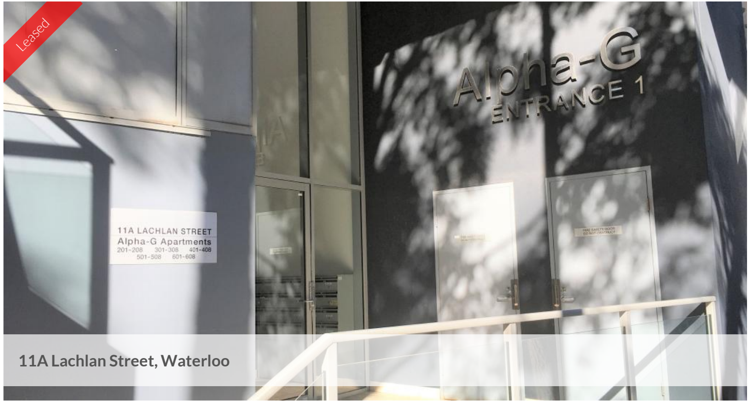
11A Lachlan Street, Waterloo